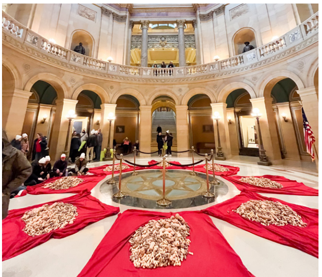
The March for Life on Jan. 22 featured a display of 12,000 life-size unborn baby models.